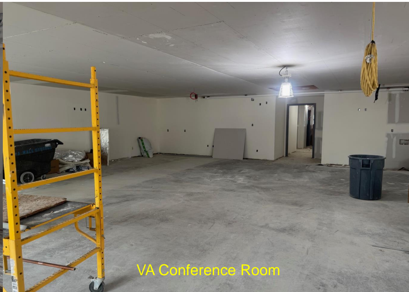
VA Conference Room