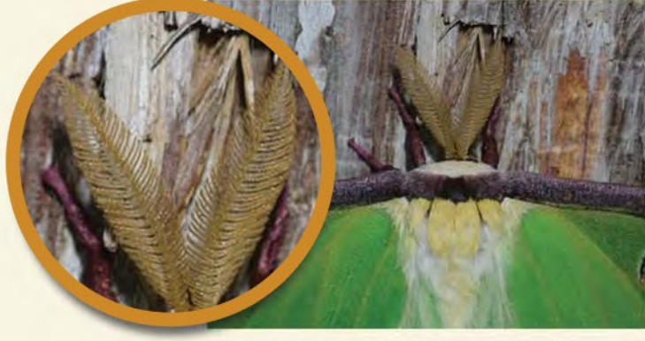
Male moths have feathery antennae which help them detect female sex pheromones.