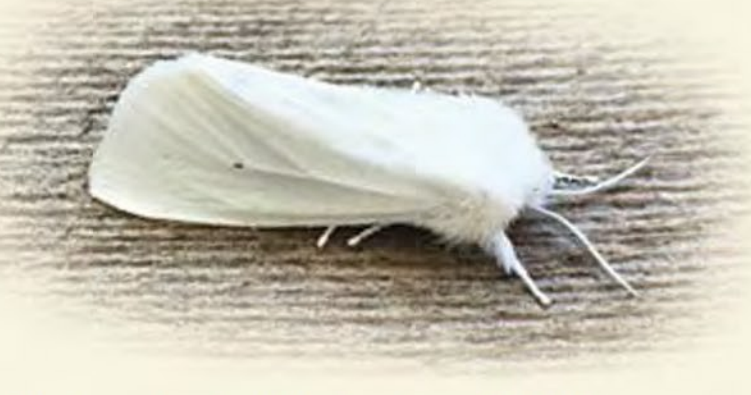
Most moths hold their wings flat, like paper airplanes, or slightly pitched, with the forewings over the hindwings, covering their body like a tent.