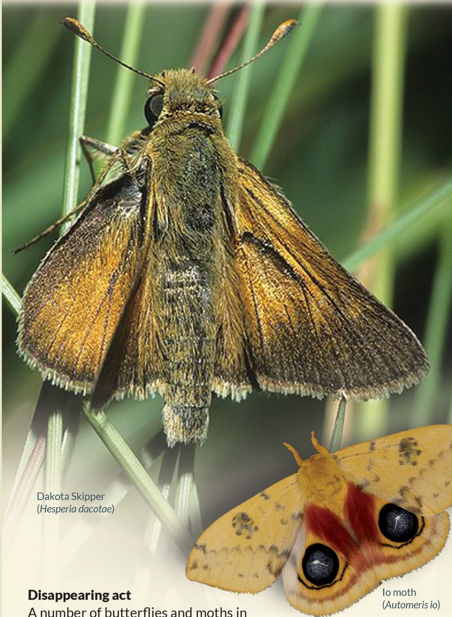
Dakota Skipper ( Hesperia dacotae )