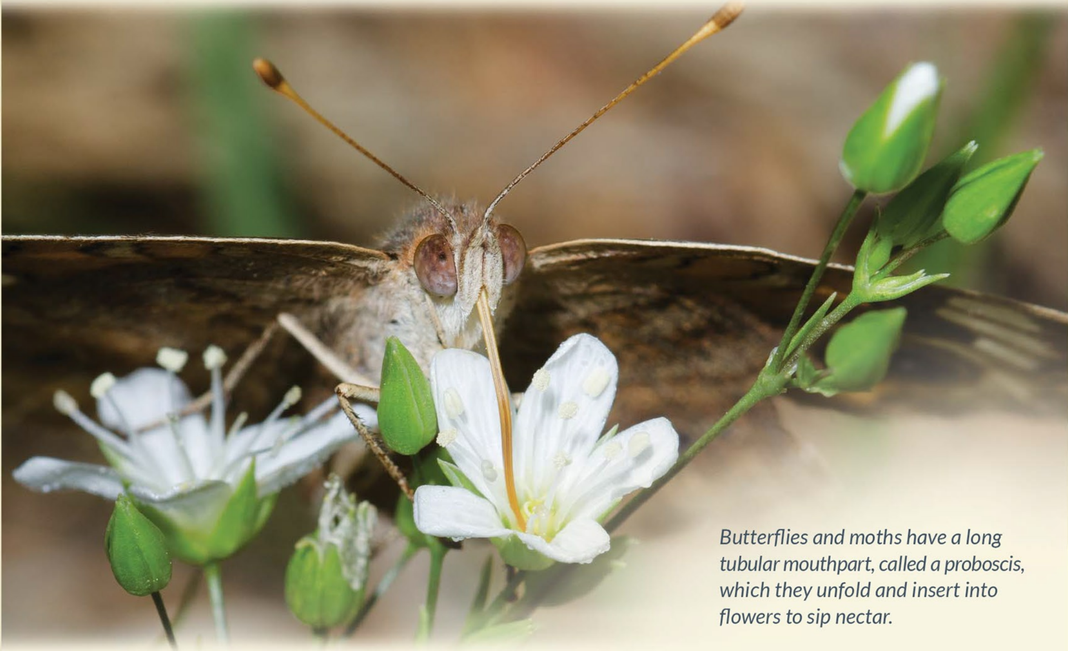
Butterflies and moths have a long tubular mouthpart, called a proboscis, which they unfurl and insert into flowers to sip nectar.

Energy-rich nectar is the primary food source for most adult butterflies. They have long, tubular mouthparts that they unfurl and insert into flowers to sip nectar. Some butterflies obtain sugar from tree sap, rotting fruit, or aphid honeydew. To acquire additional nutrients, minerals, and salts, butterflies, males in particular, sometimes seek liquid from carcasses, animal waste, puddles, and moist soil. Some adult moths also sip nectar, but there are many moths that do not consume anything as adults, living just long enough to mate and deposit their eggs.