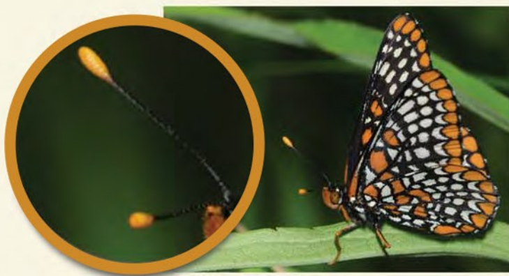
Butterfly antennae have a clubbed bulb-like tip.