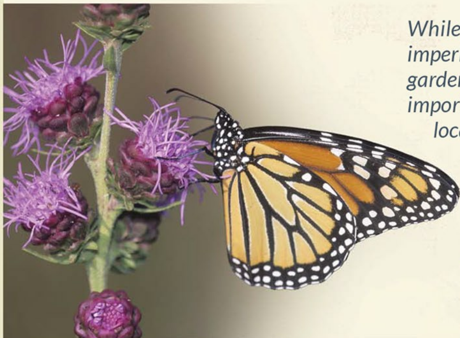
While it's unlikely that Iowa's most imperiled butterflies will appear in your garden alongside common buckeyes, it's important to realize how actions at both local and regional levels can contribute to the conservation or decline of these species. Every patch of habitat makes the landscape better for butterflies, reducing the pressure on declining species.

A number of butterflies and moths in Iowa are in decline, with some on the verge of extinction. Many of these species are habitat specialists. For example, several butterflies that depend on prairie habitat have disappeared from Iowa in recent years, including the Poweshiek skipperling ( Oarisma poweshiek ) and the Dakota skipper ( Hesperia dacotae ). But butterflies and moths that were once broadly distributed are also struggling, including giant silkworm moths (family Saturniidae) and the monarch butterfly ( Danaus plexippus ). Butterflies and moths face a wide range of threats, including habitat loss and fragmentation, climate change, pesticides, invasive plants, introduced predators and parasites, and diseases. Loss of both host plants for caterpillars and places with nectar-producing flowers can have a profound impact on butterfly populations and are the leading causes of decline.