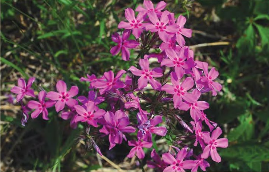
Butterfly-pollinated plants often bloom during the day and provide nectar at the bottom of a long narrow tube or spur. The flowers butterflies prefer often have a sweet odor, typically provide a large enough surface for a butterfly to land on, and have blooms in colors that butterflies can see, usually red through violet on the color spectrum and often in ultraviolet.