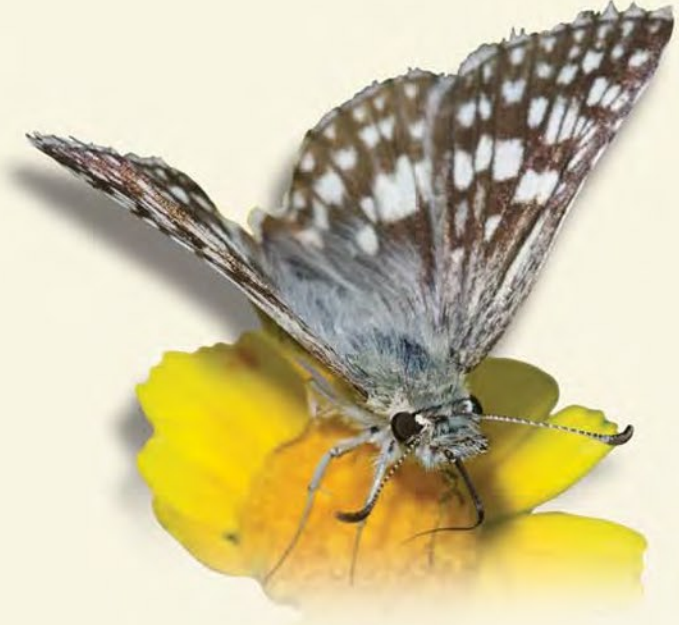
Butterflies tend to hold their wings either partially open in a V-shape or pressed together.

Butterflies and moths can be difficult to tell apart. It is easiest to distinguish between them when they are at rest, as illustrated by these photos.