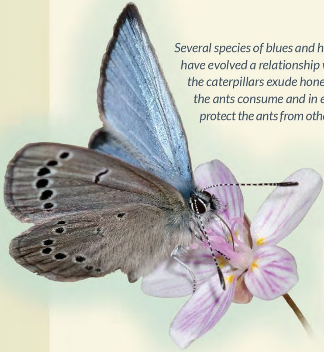
Several species of blues and hairstreaks have evolved a relationship with ants; the caterpillars exude honeydew that the ants consume and in exchange protect the ants from other predators.

Butterflies may well be the best loved of all insects. For millennia, these large and showy insects have attracted the attention and admiration of people around the world. In addition to their beauty and grace, butterflies and their close relatives, moths, play important ecological roles. For example, many birds are reliant on butterfly and moth caterpillars as a food source for their young, and as fuel to maintain the high energy levels required for migration. Small mammals, reptiles, and a number of invertebrates also dine on caterpillars. Butterflies and moths are also pollinators of a number of plants, including prairie phlox ( Phlox pilosa ), a plant that relies on butterflies for pollination, and the western prairie fringed orchid ( Platanthera praecleara ), which is pollinated by hawk moths.